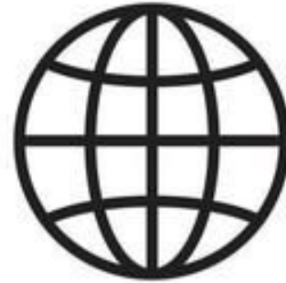
Web application Accessed through desktop and/or mobile browser